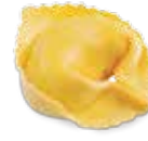
Tortellone al Tartufo