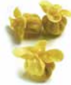
Sacchetti di Pera